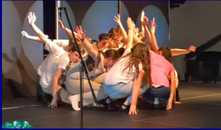
Students dancing at the Performing Arts Showcase this week